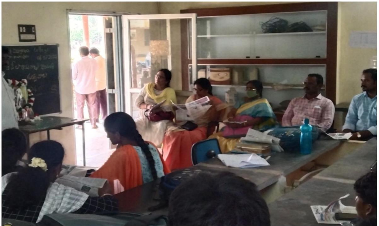
Gathering discussing about the great deeds of Alluri