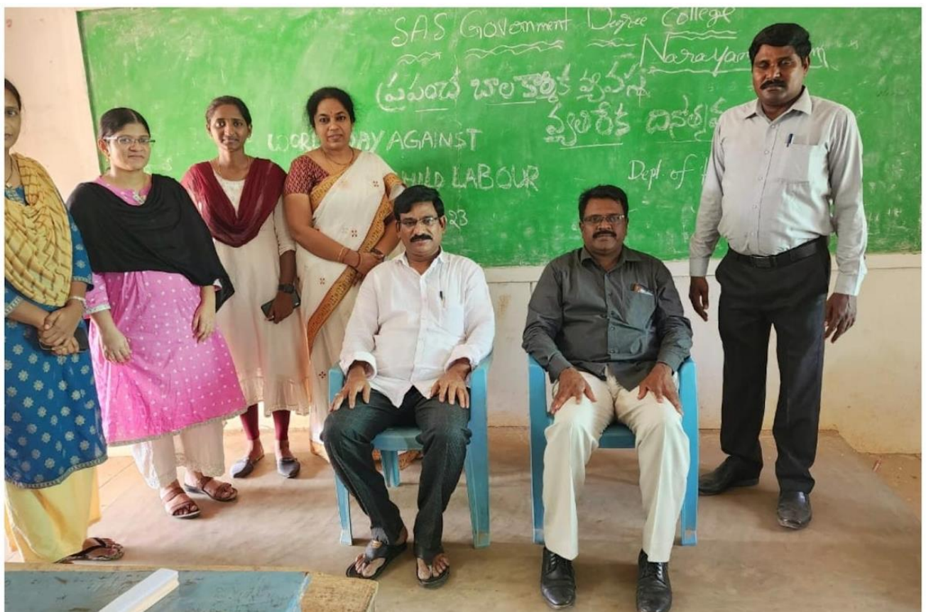
Faculty against child labour