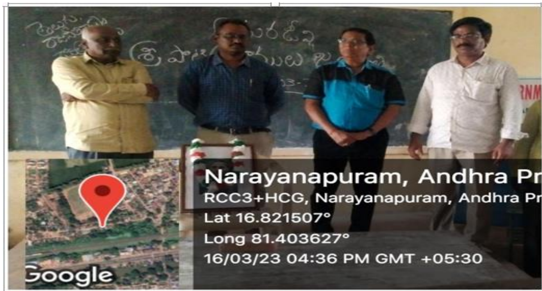
Key speakers of the event

The Potti Sreeramulu Birth Anniversary Commemoration organized by the Department of History was a fitting tribute to a visionary leader who championed the cause of linguistic and cultural rights. Through insightful speeches and discussions, the event celebrated Sreeramulu's legacy and inspired attendees to continue his efforts in promoting linguistic equality and cultural diversity.