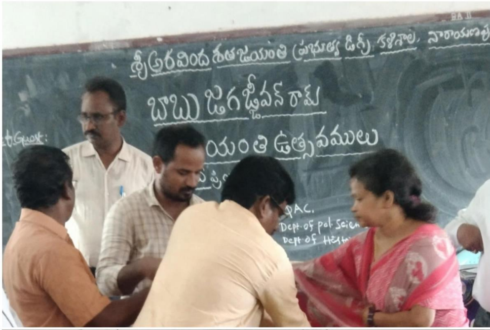
Lecturers honouring the late President of India

The Birth Anniversary Commemoration of Babu Jagjivan Ram organized by the Department of History and Political Science was a meaningful tribute to a towering figure in India's history. Through insightful speeches, departmental participation, and student engagement, the event celebrated Jagjivan Ram's legacy and highlighted his enduring relevance in contemporary times. It reinforced the importance of upholding his principles of social justice and empowerment as we strive for a more inclusive and equitable society.