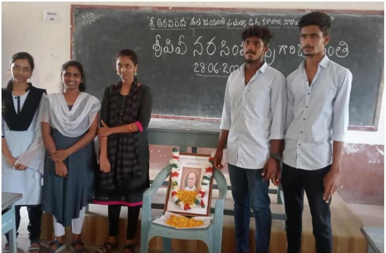
BA Students in the Occasion